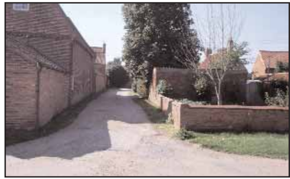
Spaces between buildings contribute towards the character of the village

8.32 In some areas it also emphasises the importance of open spaces and how they can positively contribute towards the character of an area or the setting of a building. Spaces between buildings can be as important as the buildings themselves in the way they project, emphasise and shape the character and appearance of the settlement.