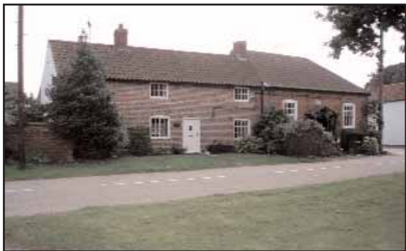
Chapel Cottage and the converted Methodist Church on the Green

8.21 The main southern and northern entry points are the two legs of Low Road, which is the spine of the old part of the village. All views from the entry points across The Green display generally good townscape quality with perhaps the view across from Church Lane towards Cherry Tree Cottage and The Hollies being the weakest. Here there is little in the way of quality traditional buildings or other features of interest to help knit the space together and link the property boundaries visually with the closest entry points. The hedge in front of The Hollies is arguably the only feature and visual reference point