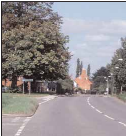
Attractive view along the main road Chaise House in the distance