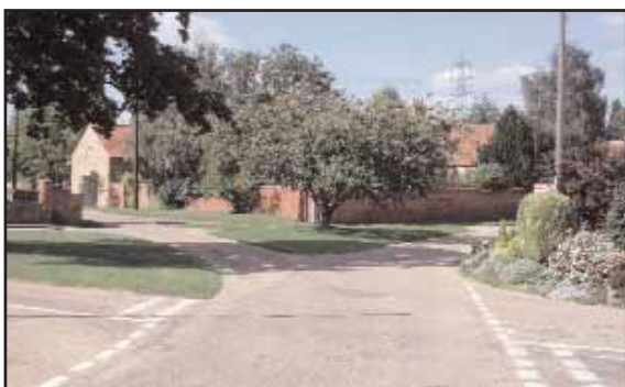
Views across The Green to Low Street