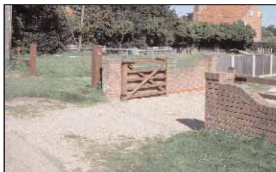
Open paddock with Chaise House in the background