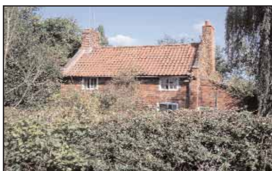
The Cottage, one of the villages listed buildings in need of attention

8.38 The road beyond is a very narrow space, a grass verge beneath a tall roadside wall giving a bit of additional width. The scale of the cottages is significantly smaller than the buildings around the barn but the three main buildings contribute significantly to the character of the area close to the junction with Fleet Lane. The informal feeling is greatly helped by the disposition of the blocks in their own grounds and the presence of mature trees and hedges in abundance. The condition of the only listed cottage on Low Road is a cause for concern