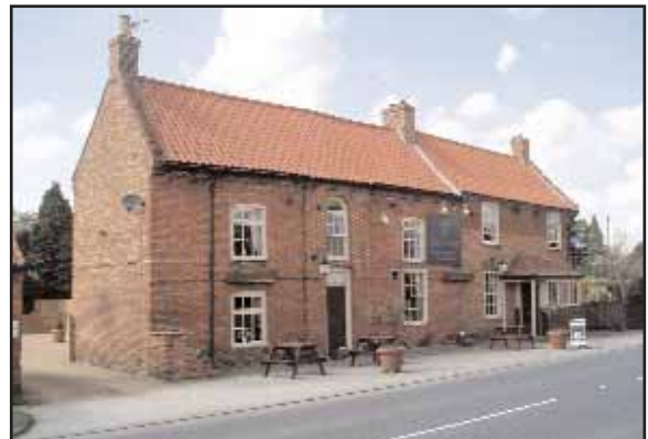
The Lord Nelson public house on the eastside of the road