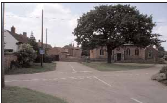
Buildings behind the Church give depth to the views

8.35 Set behind a wide grass verge the walls and hedges which enclose the street are an important linking feature, particularly as the buildings on the west side of the road are generally set well back. The sheer size of Manor Farm tends to draw the eye but overall the mix of boundary features, spaces in front of the buildings and the impact of various trees define the character. Beyond the single storey block attached to the front of Chestnut Cottage, a large square paddock gives even more depth to the road frontage and presents an unexpected setting to a number of buildings set behind the line of the established street frontage.