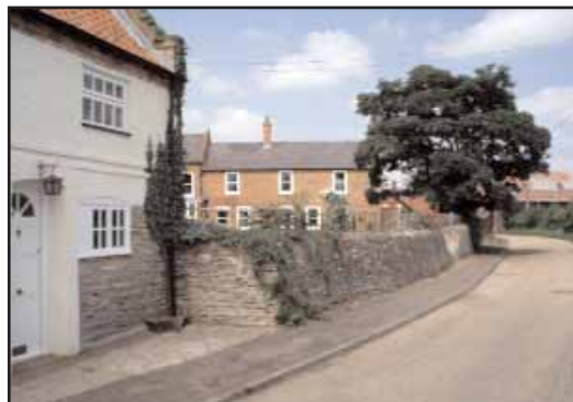
Manor Cottage and The Manor on Low Street