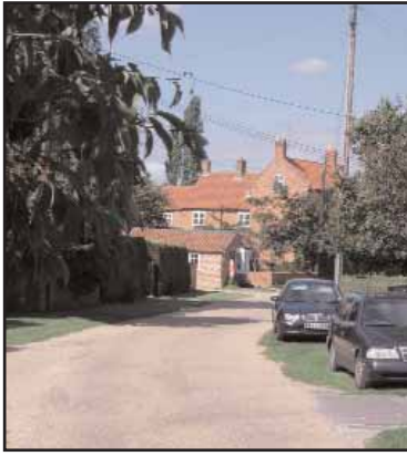
Views along Low Street north of The Green