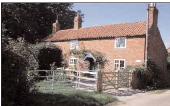
Willow Cottage presents a pleasant south facing front

8.37 The barn has an important role to play, the long roadside elevation enclosing the space which could have been quite open as the paddock to the south of Chaise House projects into the view. Maple House is a more modern dwelling set opposite the barn but it is only really contributes when viewed from the north end of the road. The group of trees along the north side of the paddock terminate a pleasant view.