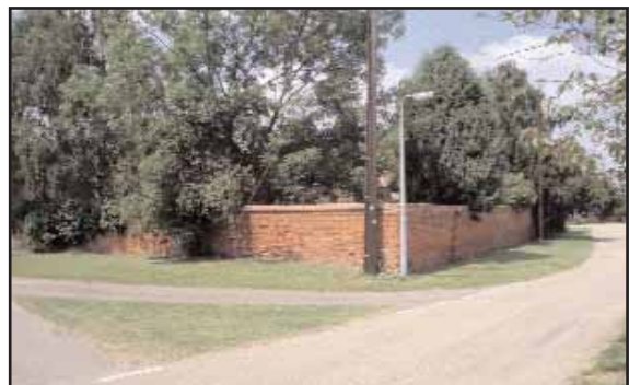
The listed wall at Slacks Farm

8.22 The view from The Hollies corner though, across The Green to Slacks Farm is quite expansive but isn't dominated by either trees or buildings; it is just a very pleasant view over the space. The importance of the boundary wall to the farm though is quite immense in townscape terms. From the corner of The Green the wall, which is approximately 6ft high, provides both a focal point and a feature that visually links Low Road and Church Walk together. It also provides a pleasant contrast with the wall and railings in front of the Church on the south side of Church Lane. It is also another linking feature that provides a degree of enclosure, which, when taken with the frontages of the converted former Methodist Church and Chapel Cottage, results in a high quality public space.