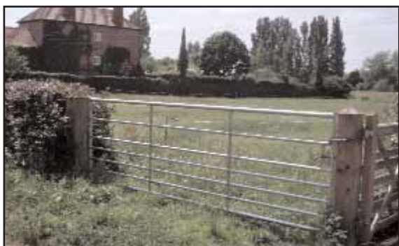
The open paddock behind Plum Tree Farm