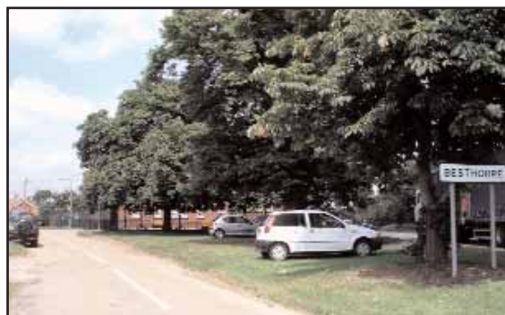
Possibly the most attractive entry to the village close to the school