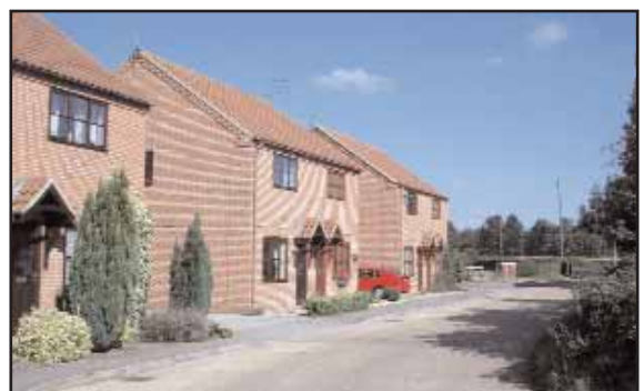
Modern development on Fleet Lane