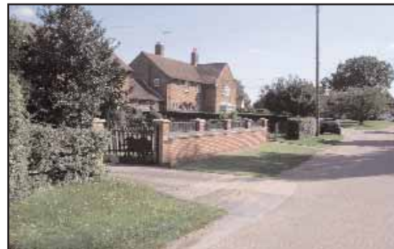
Modern development on Low Street Circa 1960

8.33 Opposite Slacks Farm a number of houses developed by the Council in the late 1960's do not have the disruptive impact that they might have had, mainly because they are set well back from the road in well matured gardens.