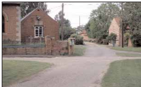
The Village Hall and Church Lane

8.25 The churchyard behind the church is an important space in the overall context of the character of The Green and the back walls of Church Cottage adds depth to the quality of the space. The east gable of the Village Hall, even though it is set back beyond the north side of the Church, also makes a valuable contribution to the townscape quality of the area though its main impact is from Church Lane itself.