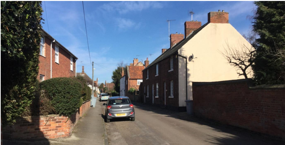
Figure 4: Quaker Lane

Quaker Lane – this is a very narrow roadway, along which at various points houses directly abut the roadside with no frontages and no footpath. In certain places, the presence of parked cars reduce the roadway to a single track. Here can be seen a range of dwellings, including older, cottage style properties, predominantly of red brick and pan tiled construction.