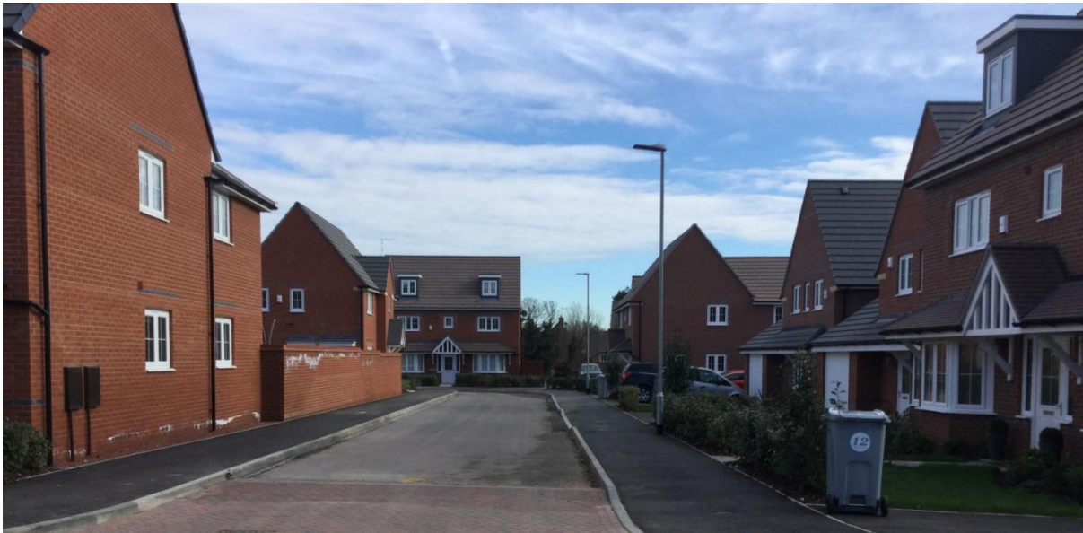
Figure 11: Yates Croft St Michaels View

This is the newest development on a green field site which commenced in 2015. The area in part is bordered by open fields and the old railway line. It is a housing estate of 88 properties in the process of being built by Barratt Homes. Part of the street scene consists of large houses with little space between the properties, some houses are close to the roadway, any shrubs and trees planted are immature and do little to soften the large amount of brickwork that is evident. There are parts which are more open in appearance and face an area of open space at the centre of the site. Some properties are three storey with roof lights and dormers in the roof. The building materials are mostly redbrick with roofs made from flat tiles varying in colour some grey and some red, there are no chimney stacks or chimney pots. Some properties are part-rendered with brickwork features around the windows. Features in the roadways include herring bone design red block paving.