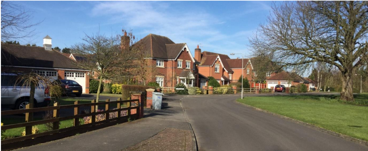
Figure 9: Parfitt Drive

Murdoch Close –Mostly Large Houses with some semi-mature trees and shrubs, open and spacious layout. The building materials are red brick with tiled roofs and brick chimney stacks.