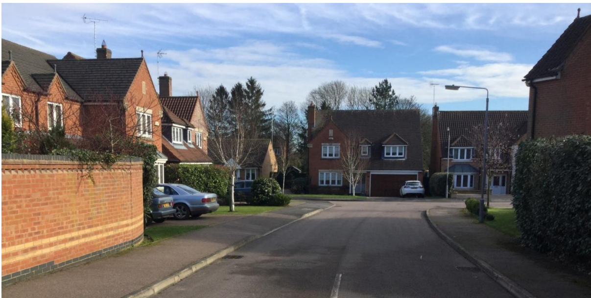
Figure 10: Murdoch Close

Murdoch Close –Mostly Large Houses with some semi-mature trees and shrubs, open and spacious layout. The building materials are red brick with tiled roofs and brick chimney stacks.