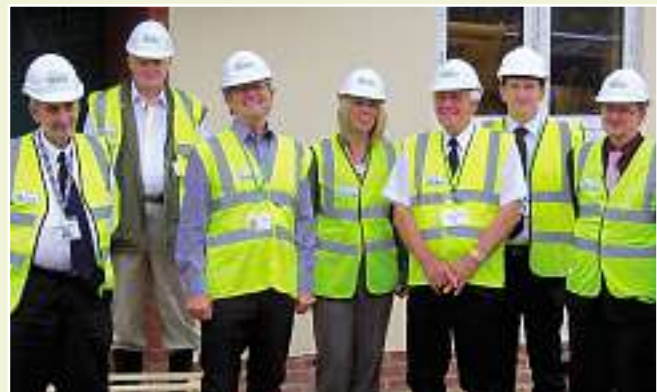
Members of the Newark & Sherwood District Federation of Tenants & Residents Association, Directors of the Board and Newark and Sherwood Homes staff surveying the site.