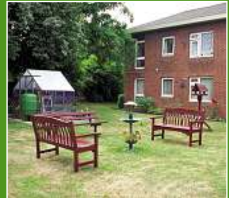
Delacy Court, Ollerton Most Improved Communal Garden