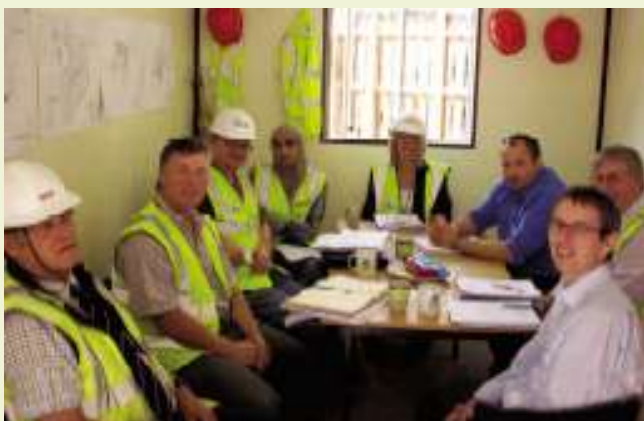
Working in partnership, delivering excellence.

Newark and Sherwood Homes hold on site meetings each month with Carter Homes, Cullen, Carter and Hill Architect, BSP Engineer and EC Harris, Employer's Agent to discuss the progress of each site in Phase One ensuring the schemes are on time and to a high standard.