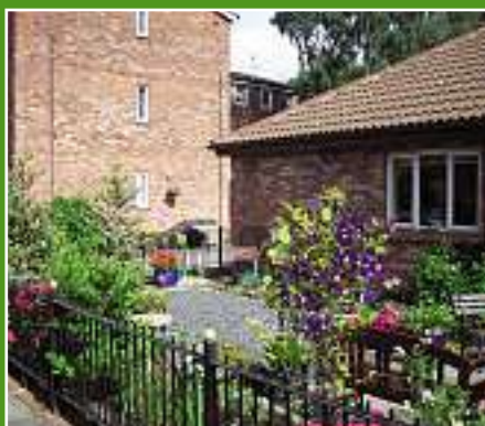
Howes Court, Newark - Communal Garden