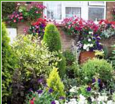
Mr Wayment, Collingham - Front Garden