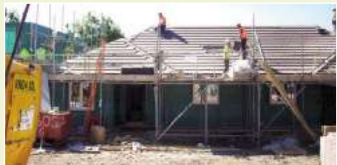
Construction of the new slate tiled roofs on the bungalows.