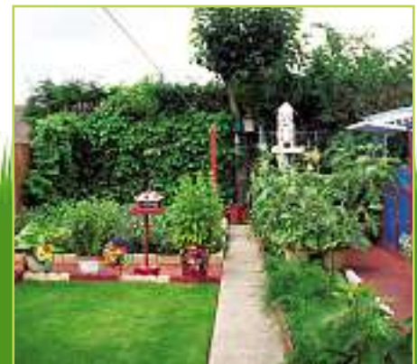
Mr Pemblington, Clipstone - Rear Garden