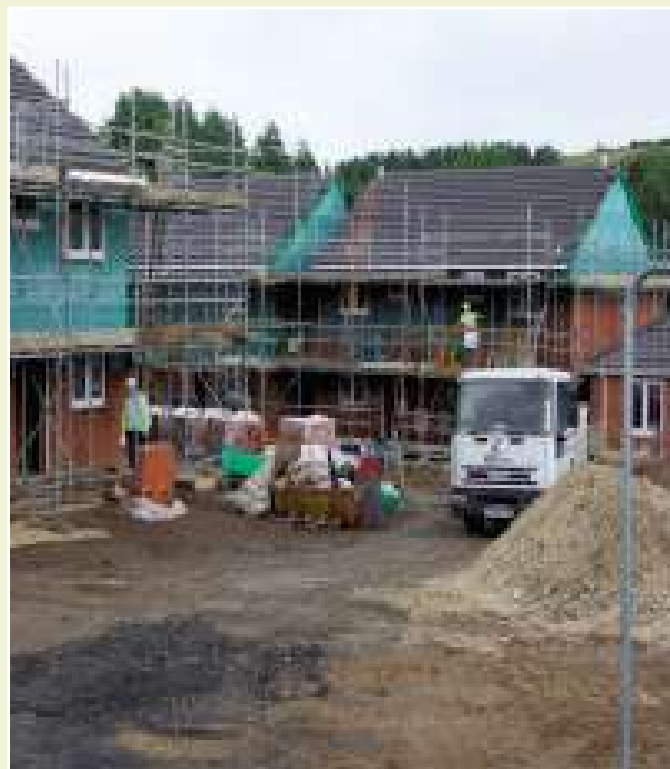
Construction of the new timber frames.

All four sites are being constructed by Carter Homes with the majority of sub-contractors being local. Newark and Sherwood Homes are overseeing a training plan involving local colleges, universities and a number of external agencies to support local people.