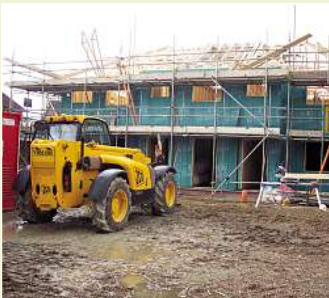
Construction of the apartments in progress.