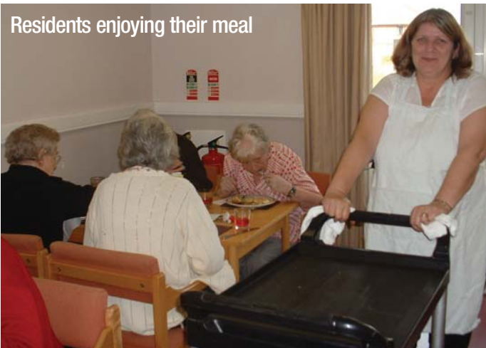
Residents enjoying their meal

At Christmas and other events the menus are extra special enabling residents to celebrate each occasion fully.