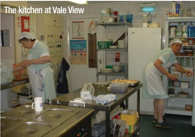
The kitchen at Vale View