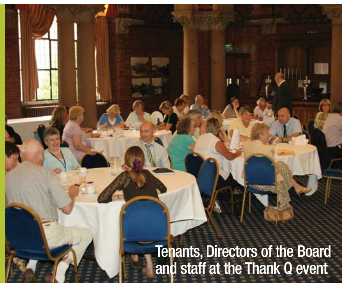
Tenants, Directors of the Board and staff at the Thank Q event