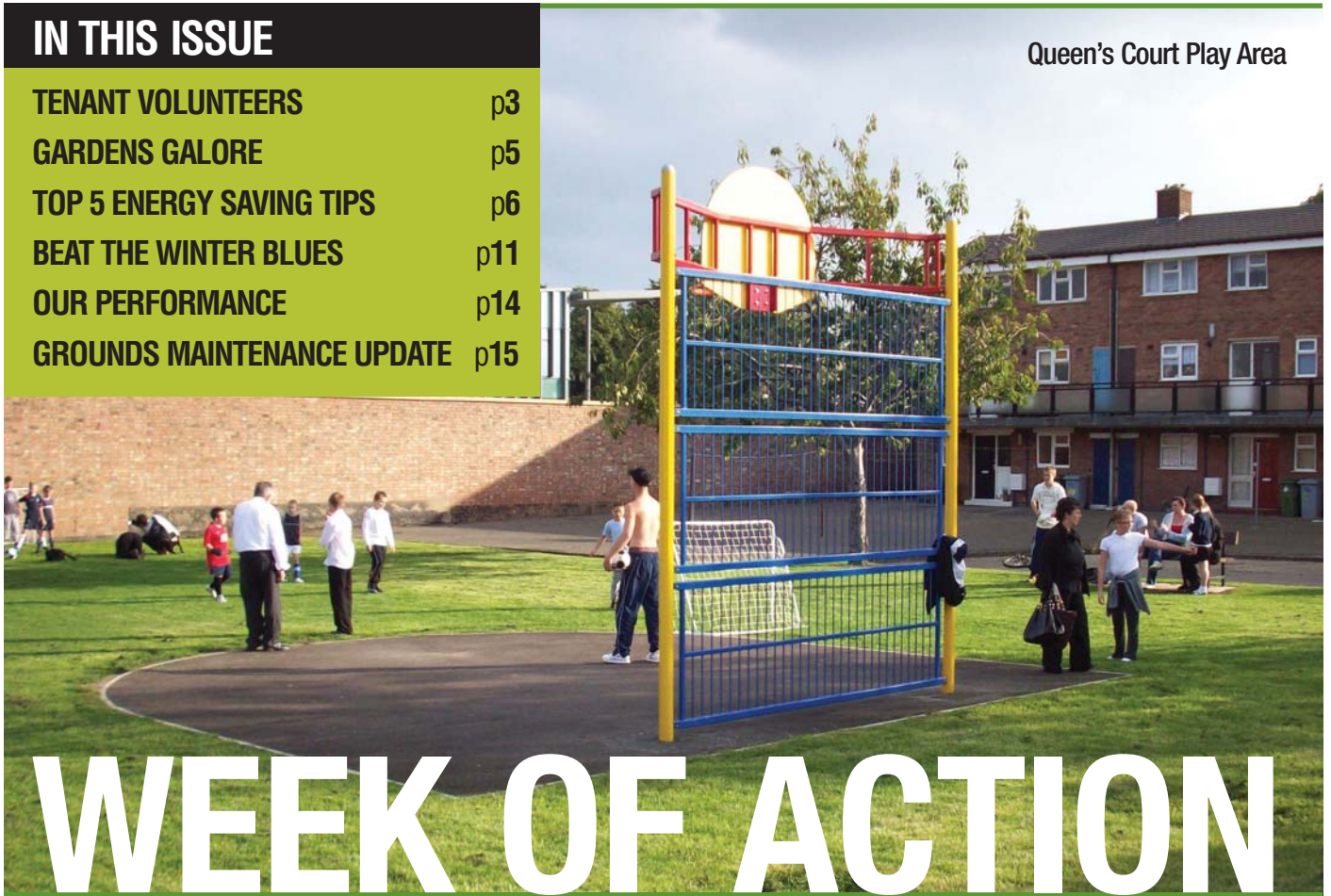
Queen's Court Play Area