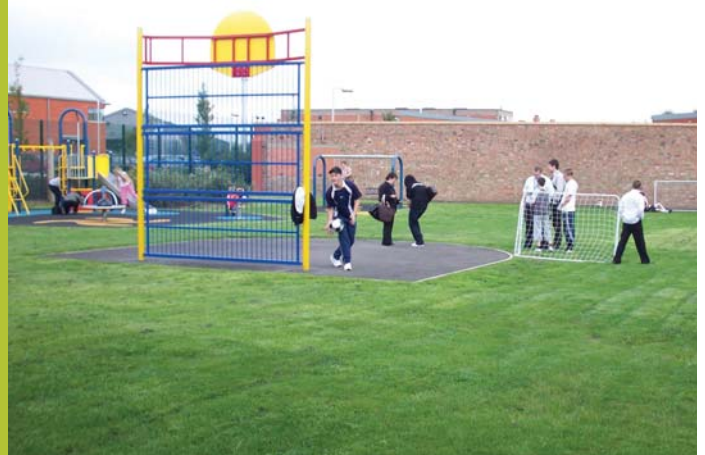
Queen's Court Play Area