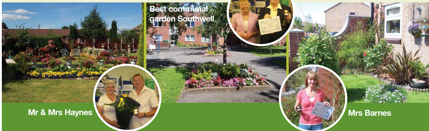
Best communal garden Southwell