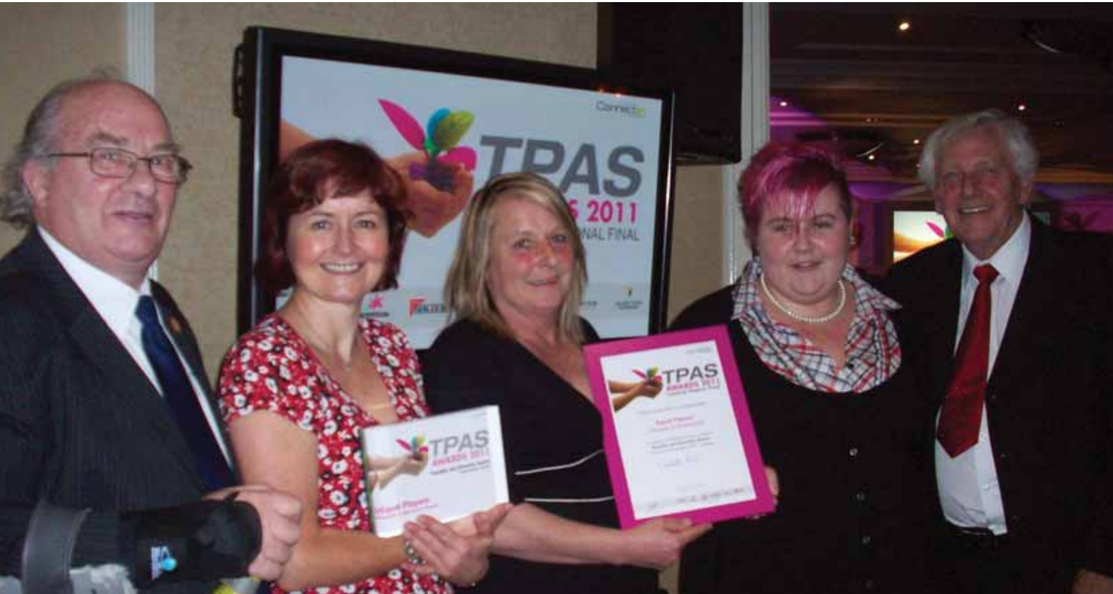
The Equality & Diversity Continuous Improvement Group receiving the award.

At the Tenant Participation Advisory Service (TPAS) awards for the central region held on 1 April, Newark and Sherwood Homes won the Equality & Diversity Award for the project called "Equal Players".