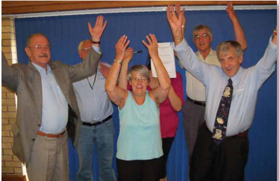
Tenants celebrating the completion of the review of the Tenants Compact

We would like to take the opportunity to thank you for the positive influence that tenants and leaseholders have